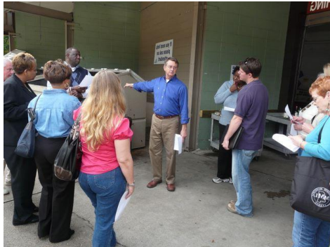
MRC Members on a tour at the 2008 SERDC Regional Recycling Conference

MRC Membership and Sponsorship invoices will be emailed in March! We look forward to your support for MRC in 2024 as we work to advance recycling in Mississippi!